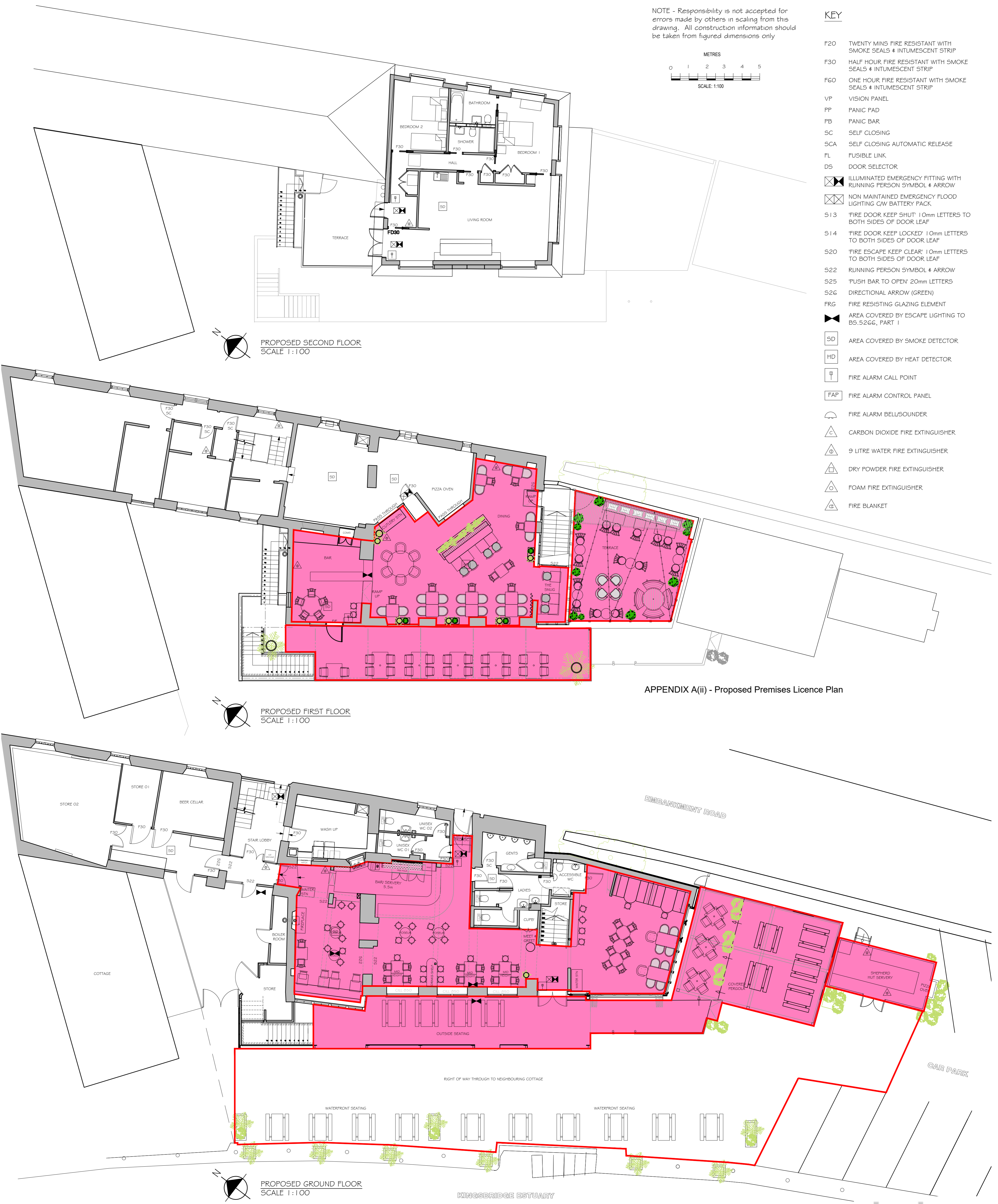
APPENDIX A(ii) - Proposed Premises Licence Plan

ALL WALLS AND PARTITIONS TO BE MINIMUM HALF HOUR FIRE RESISTANCE.